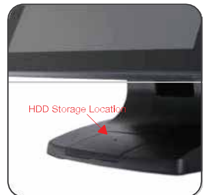
Easy HDD Maintenance