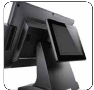
Second Display Supported