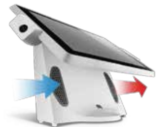
Efficient Thermal Ventilation