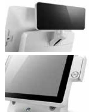
Multiple Peripheral Devices