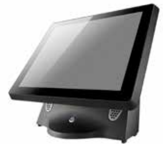
Superior Touch Display