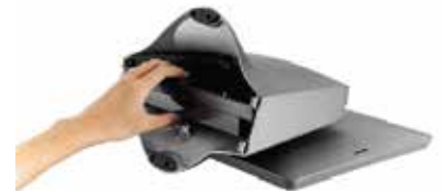
Modularized Service Box